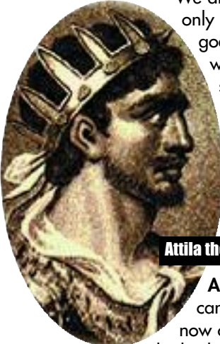
Attila the Hun

As with death-during-sex cases among the hoi polloi, nearly all of the following incidents among the rich-and-famous are alleged.