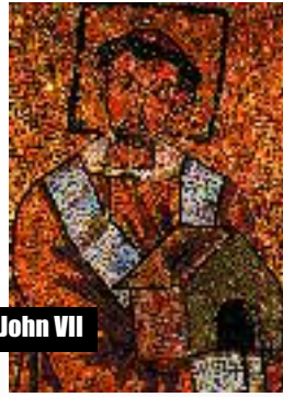
Pope John VII

Apart from their immediate family members, NO ONE REALLY CARES when an anonymous dirtball peasant dies during sex. The story might be good for a few days' worth of chuckles, but ultimately any person who trudged through life as a nobody will become even more of a nobody upon their expiration. The cruel, lacerating fact is that they don't exist anymore, and within a few years, there will be strong doubts as to whether they existed in the first place.