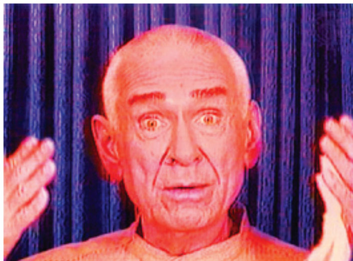
NAME: MARSHALL HERFF APPLEWHITE CULT: HEAVEN'S GATE

Most people search desperately for life's meaning because it terrifies them to think that it has none. They need answers. They