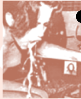
they crawl over one's genitals